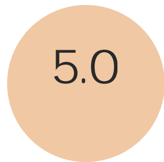
AVERAGE TIME TO DEGREE